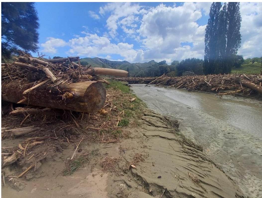
An example of where the debris has travelled from a pine harvest forest, where the tree has been cut is obvious. Slash to a mean depth of c.3m on right of photo.