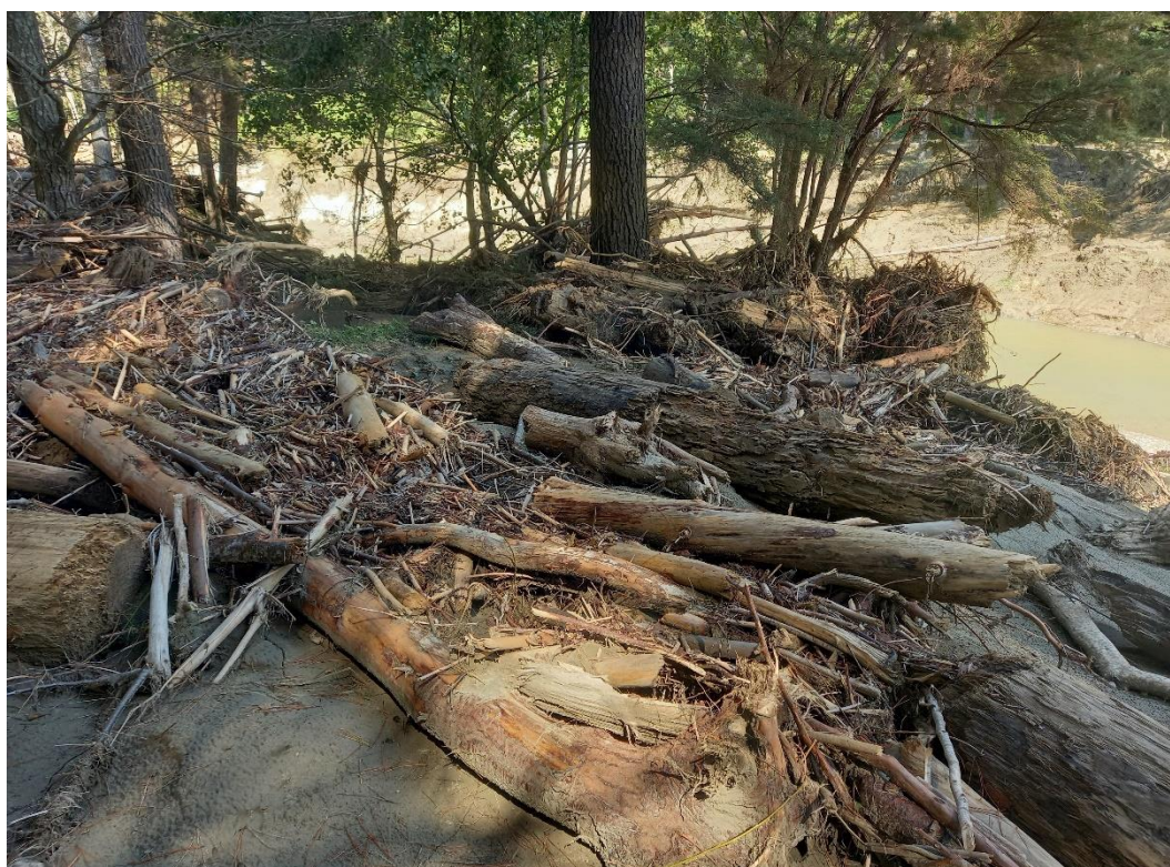
WR2 – Site two on the Waimatā River, east of the 10km mark of the Waimatā Valley Road. Pine debris has been caught in kānuka and another Pinus radiata plantation on the true left bank of the river.