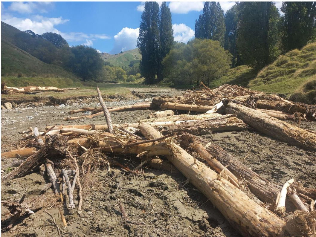
WR6 – Monowai Station, Waimatā tributary stream. Pine waste has mostly built up on the true left with some scattered on the true right.