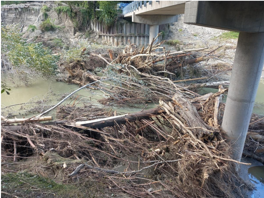
WR3 – Watson's Bridge, Linburn Road over the Waimatā River. A mix of pine, one macrocarpa and silver poplar has collected beneath the bridge.