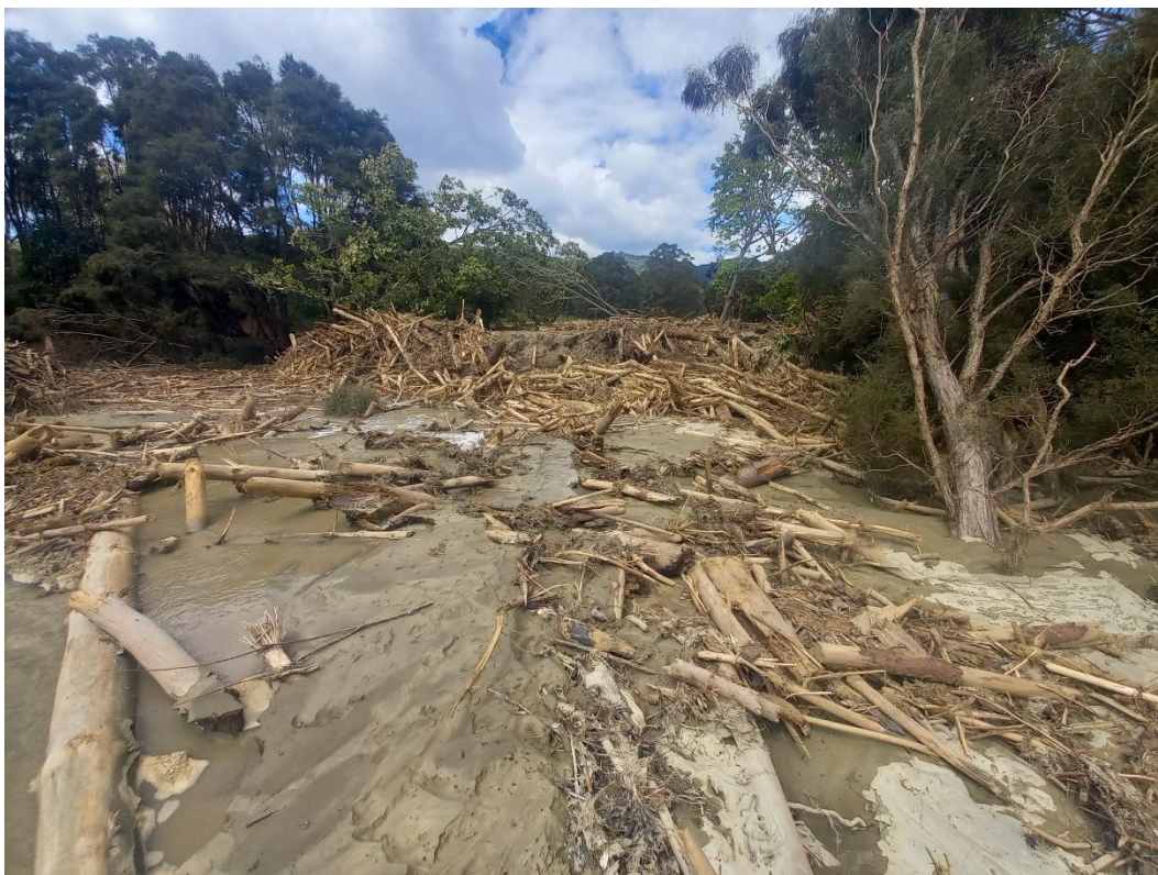
Accumulation of pine debris in the Waimatā River, downstream of the 18km culvert which became blocked during the cyclone.