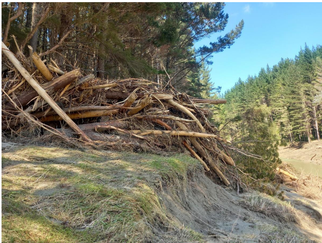
WR1 – Site one on the Waimatā River, around the 10km mark of Waimatā Valley Road. A large build-up of primarily pine debris is on the true left of the river.