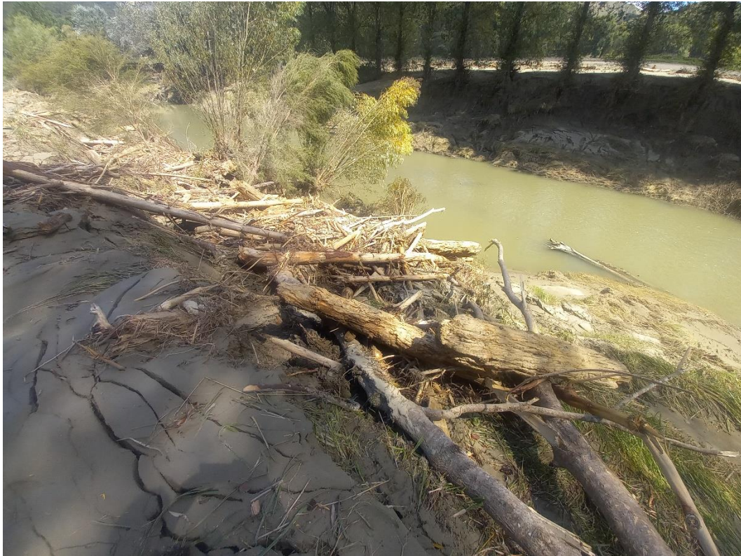
WR5 – Waimiro Station, Waimatā Valley. Further north of WR6, more pine forest waste has built up on the true left riverbank.