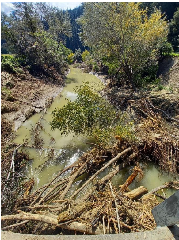
At site WR3, an example of how trees that fell in the storm or flooding typically remain in place due to their root structures.