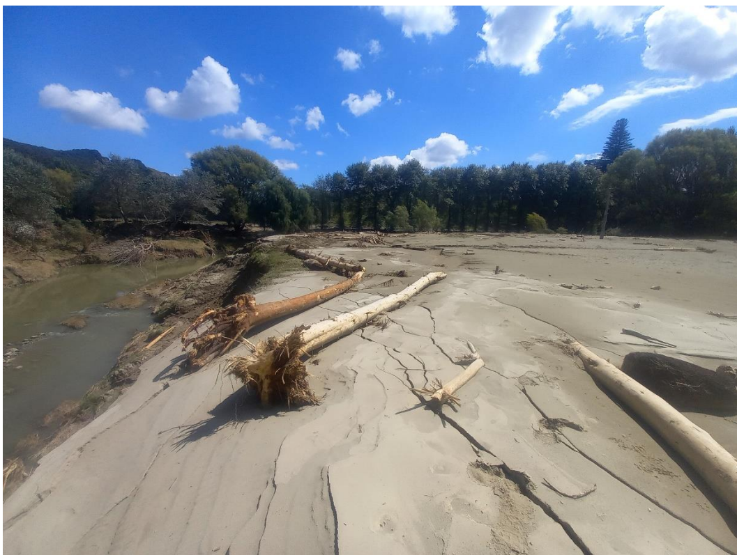
WR4 – Waimiro Station, Waimatā Valley. A paddock on the true left of the river has been completely covered in a thick layer of silt with identifiable parts of pine scattered throughout.