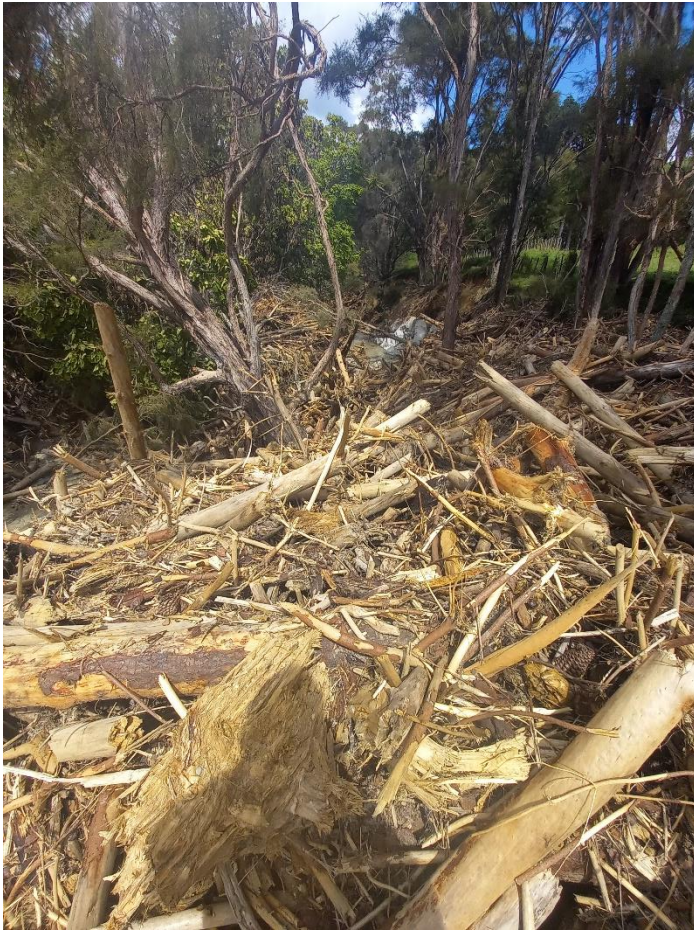
WR9 – Waimatā River, downstream from 18km mark culvert – 2+ metres deep in slash.