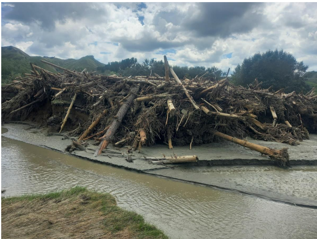
WR8 – Waimatā Valley 18km culvert. Mainly on true left bank of main river channel, downstream a few metres (WR9) piles are on both banks are c.3 metres in height.