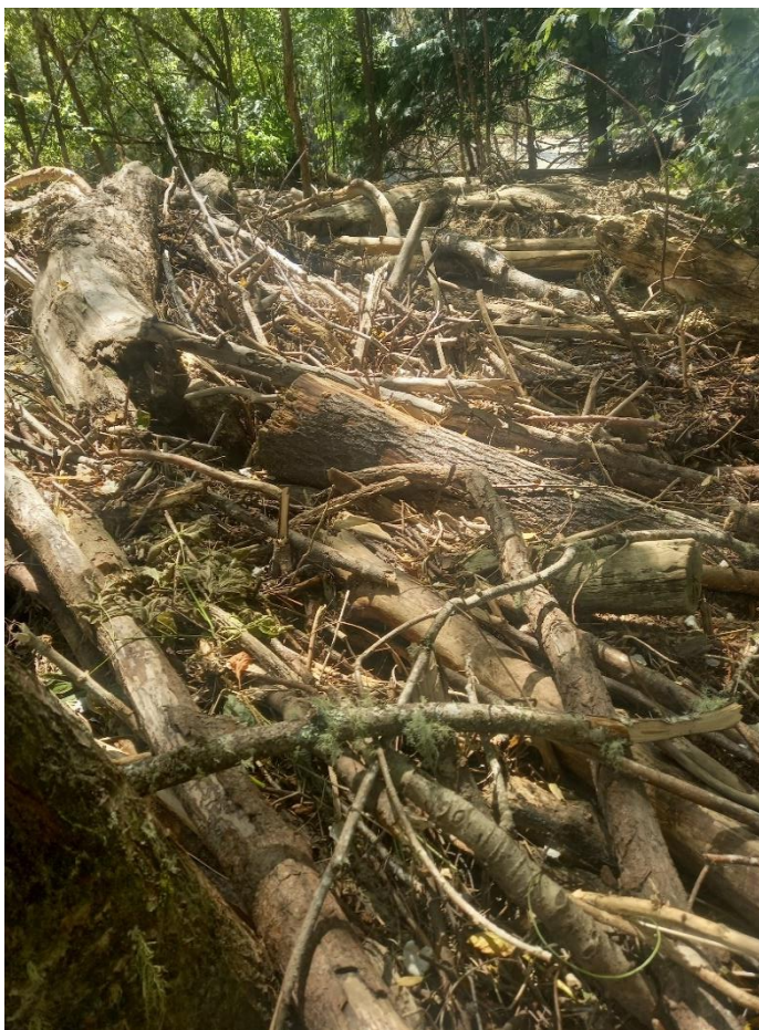
WR7 – Monowai Station, confluence of tributary and Waimatā rivers. Debris piled up on island in between, extending out from a paddock inundated by silt.