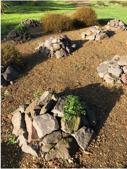
Figure 11. Stone mound planting in quincunx formation, May 2010