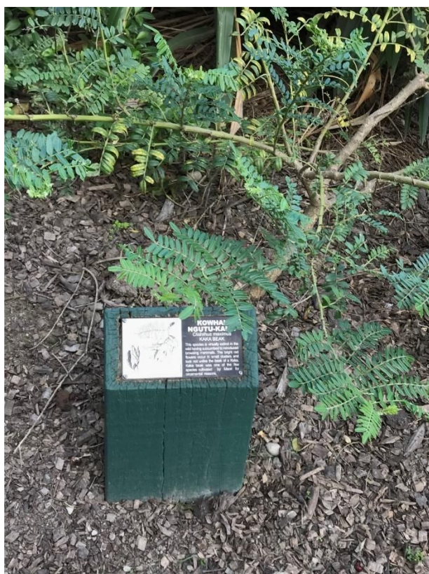
Figure 6. Example of a plant interpretation panel, Banks Garden, photo Author 1, May 2018