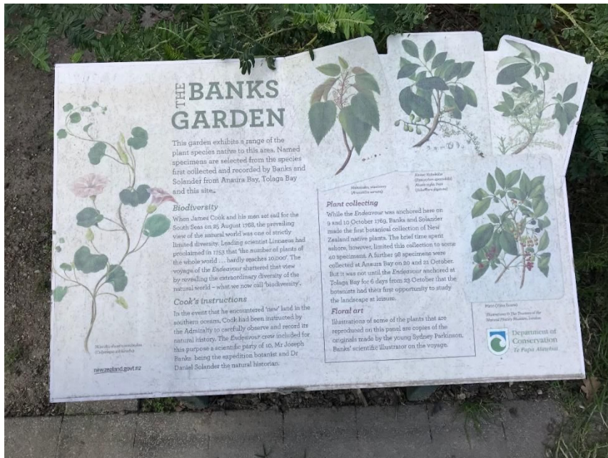
Figure 5. Interpretation panel for the Banks Garden, photo Author 1, May 2018

Banks Garden was established. 8 The Banks Garden consists of a linear garden along the edge of the historic reserve area, with living specimens of the species that were gathered and listed by Banks and Solander. An overall explanation of the garden is provided, as well as small interpretation panels for each plant (Figs 5 and 6).