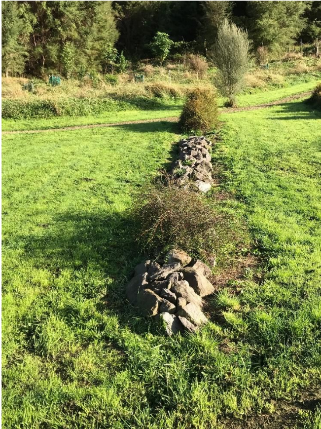
Figure 10. Stone wall planting, photo Author 1, May 2018

Planting is laid out not in a 'museum' format as at the Banks Garden, or in a formalistic approach as at the Endeavour Garden, but in a form that is of this place. The plants are grown within stone walls and mounds laid out in a quincunx grid, techniques traditionally used by Māori (Figs 10 and 11). This formation was noted by the Endeavour crew when they visited Anaura, just north of Gisborne, and William Monkhouse wrote of how the ground around the gardens was clear of weeds, and "...The Sweet potatoes are set in distinct little molehills which are ranged some in straight lines, in others quincunx." 14 As in the work of Leatherbarrow et al, 15 the use of the forms at the 1769 Garden might be called a 'quotation', or it could be classified as a ' calque ' 16 . Designer Philip Smith explained that, "These stark pieces of geometry give it guts and relate to what part of landscape looked like in 1769." 17