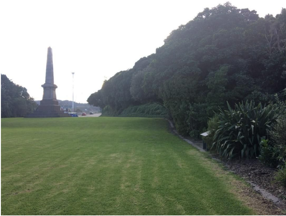
Figure 3. Banks Garden on the right, Photo Author 2, May 2018