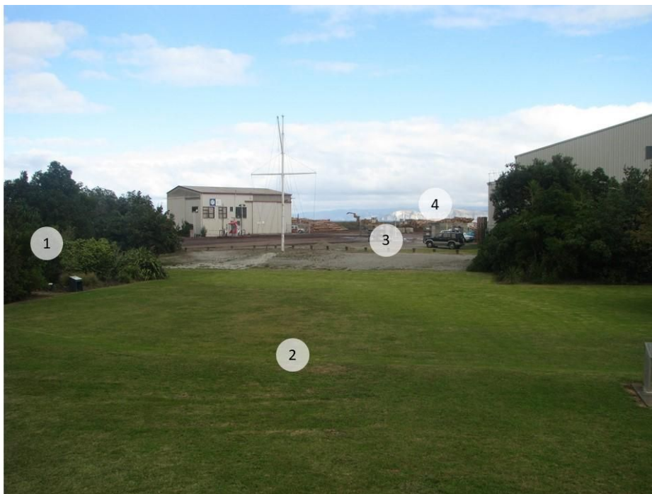
Figure 4. Banks Garden (1), slight change in level through centre of site is the original shore line (2), and everything beyond this is reclaimed. In the middle distance are stacked logs on reclaimed port land (3), and in the far distance, Young Nick's Head / Te Kuri a Paoa, across Poverty Bay (4). from an earlier visit in May 2010.

On 9th October 1990 the Cook Landing Site was declared a National Historic Reserve and it came under the management of the Department of Conservation (DOC). Simon Smale, a DOC landscape architect, developed the landscape plan for the site and it is understood that this is when the