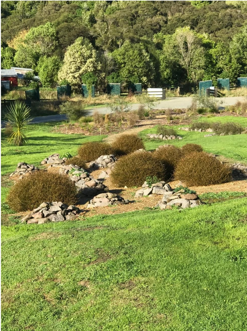
Figure 9. The 1769 Garden