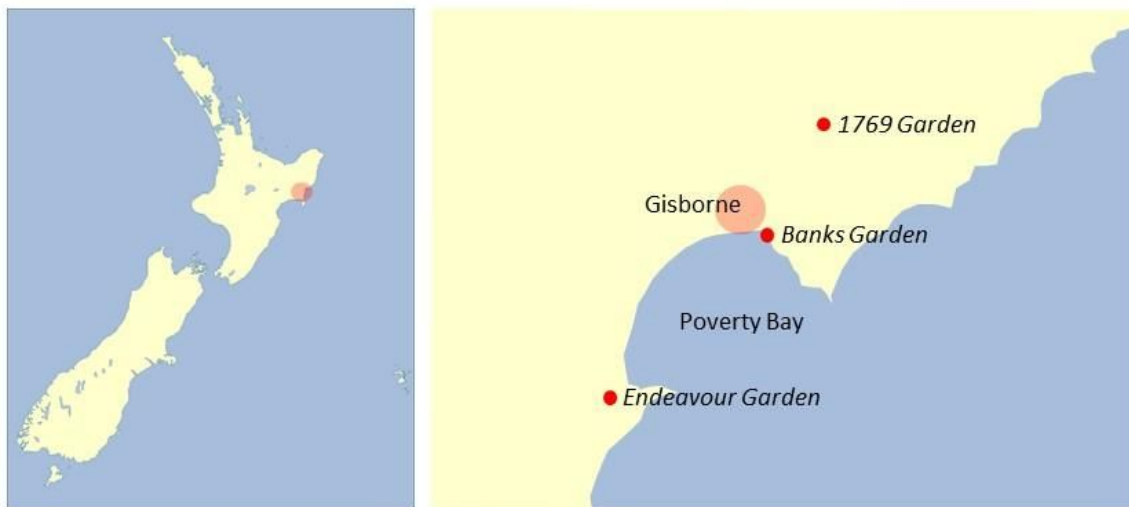
Figure 2. Location of the three gardens (drawn by author, based on map in public domain)

Although not historic in themselves – the oldest being no more than 30 years old – three gardens in Gisborne reference the history of plant collecting in the region. The Banks Garden, Endeavour Garden and 1769 Garden each present an interpretation of that short period of plant collecting in October 1769 (Fig.2).